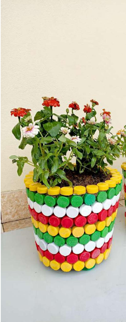
Plastic bottle tops recycling (Flower vessel)