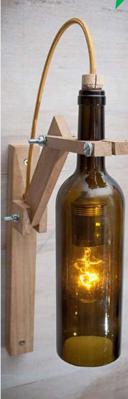
Spirits bottles Recycling (Bulb stand)