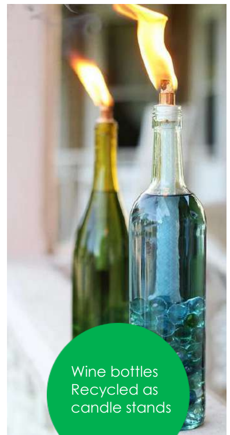
Wine bottles Recycled as candle stands

As we strive to manage waste, we can put to use the available labor by training it how to turn waste into wealth.