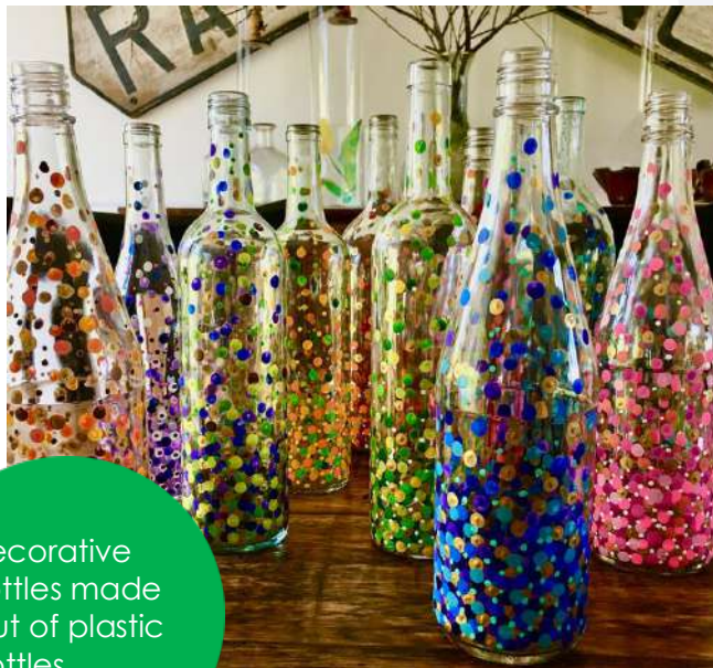
Decorative Bottles made Out of plastic bottles